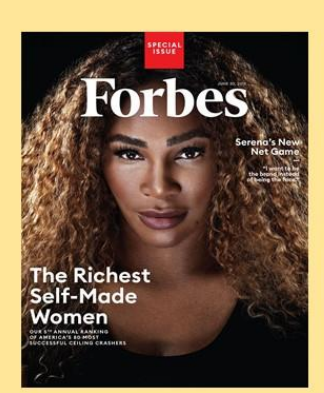
RBC was featured in this issue of Forbes Magazine